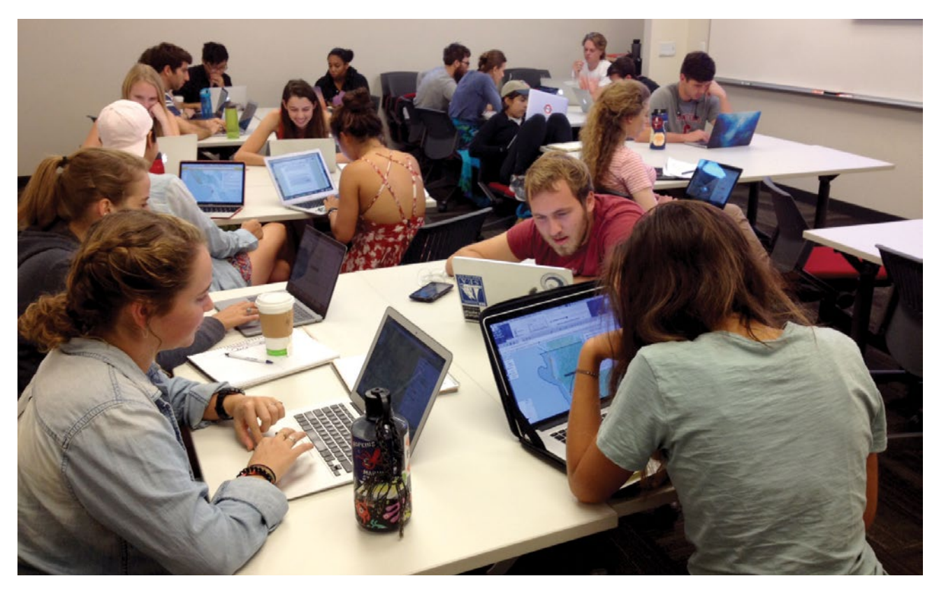
Students learning how to map and place value on coastal habitat during a coastal vulnerability lab.