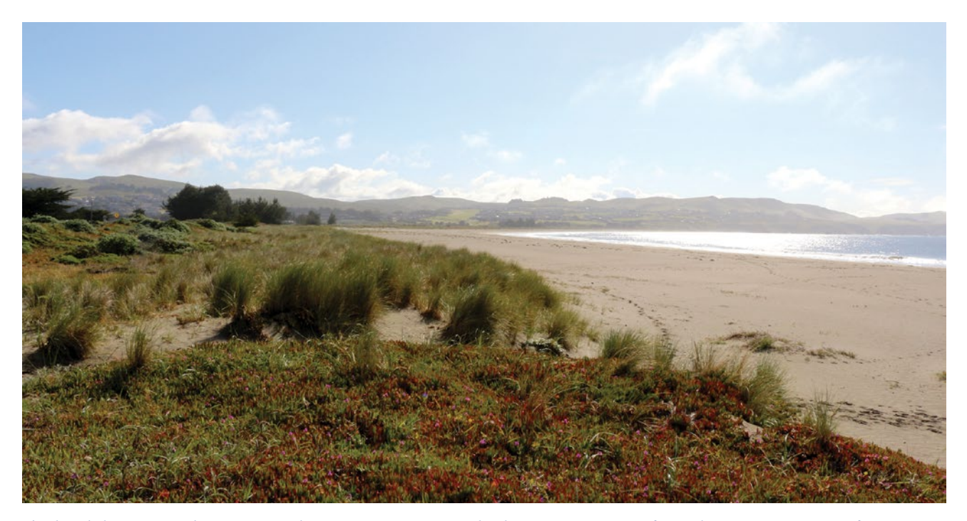
The dune habitat surrounding Doran Beach in Sonoma County provides the ecosystem service of coastal protection.

Ecosystem Services are the stream of vital benefits flowing from natural capital to people. Examples of service flows that are vital to humanity include the production of goods (e.g., food from fisheries that depend on nursery habitat) and services (e.g., coastal protection from dune or wetland habitats). Coastal habitats provide one of many ecosystem services by reducing impacts from storms and increase resilience in coastal areas. However, with ever increasing human pressure on ecosystems, we need ways to identify, map, and place value on where natural habitats provide the greatest benefits to coastal communities in order to prioritize adaptation planning efforts that protect or restore those critical natural habitats. To support decision-makers in their efforts to