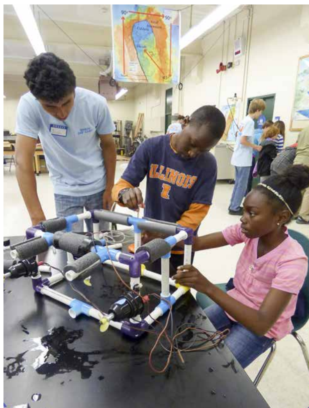
FIGURE 3. High school students mentor teams of campers, suggesting potential pathways to complete an activity or a design criteria inspired by the campers. Here the campers design a manipulator system that attaches to a PVC ROV that was designed, built, and tested earlier in the day.

Mentoring also is instrumental in the camp experience. The camp staff works with numerous counselors who are high school and early collegiate students. High school students are currently recruited from the Monterey Academy of Oceanographic Science and the Robotics Club at Presentation High School (the latter is a school for young women). While the counselor’s primary role is to ensure the safety of the campers, they also mentor the campers (Figure 3). While not revealing how to reach the most optimal solution(s), counselors provide advice to stimulate thought and guide campers as needed. The counselors also represent the gender and ethnic diversity of the community, providing role models for the campers.