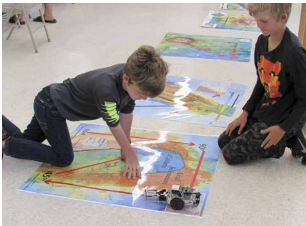
FIGURE 2. Campers program BOE Bots (Board of Education Bots, Parallax, Inc.) to understand operational issues associated with autonomous benthic rovers within the context of a prescribed feature on the seafloor. In this case, the campers navigate around Axial Seamount, which is located off the coast of Oregon (US) and is “wired” through the NSF-funded Ocean Observatories Initiative ( www.ooi.washington.edu ).

problem-solving actions, each with an aspect of mathematics. Activities include: mechanics of using a manipulator to collect samples or pick up instruments from the seafloor, developing integrated systems to complete designated missions, and fabricating and calibrating sensors. For example, campers are given “unknown” samples for which they determine the concentration based on the calibration curve that they generate from their sensor circuit and a series of samples with known concentrations. Another example of an activity is one that focuses on operations and science conducted by seafloor rovers. Campers use computers to program small “underwater” rovers to complete designated patterns, thus learning how to program. Next, campers program rovers on a prescribed path related to their geologic setting, moving “seafloor instruments” from one site to another for “recovery” (Figure 2).